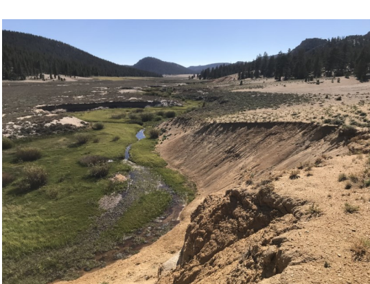
Typical GTW meadow impacts including channel incision, erosion, and vegetation conversion.

Pilot projects undertaken in two of the project meadows 2021 and 2022 show immense promise for quickly raising the water table, diversifying flow paths, deepening pools, and reconnecting floodplains. These projects already withstood summer monsoon events, indicating some degree of lasting effectiveness. Questions remain about whether LTPBR can achieve long-term, landscape-scale ecological benefits in meadow ecosystems, so we have built extensive monitoring and adaptive management components into the project to increase our understanding of how to work with mountain meadow processes and how to achieve landscape-scale success over the long-term.