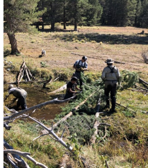
In this issue: Golden Trout Wilderness Project Spotlight

Encourage complexity, retention, and fluvial process-space.