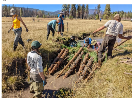
Participants in the Fall 2022 Cal PBR training construct low-tech structures in portions of Yellow Creek.